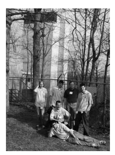
Figure 4: Vertical drop tower at NASA Glenn in Cleveland. http:// microgravity.grc.nasa. gov/DIME_IMAGES/picture2005_09.jpg

Cleveland would be ideal, if they would welcome us to use it (Figure 4).