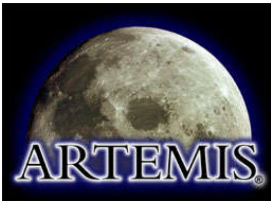
The Artemis Project Logo